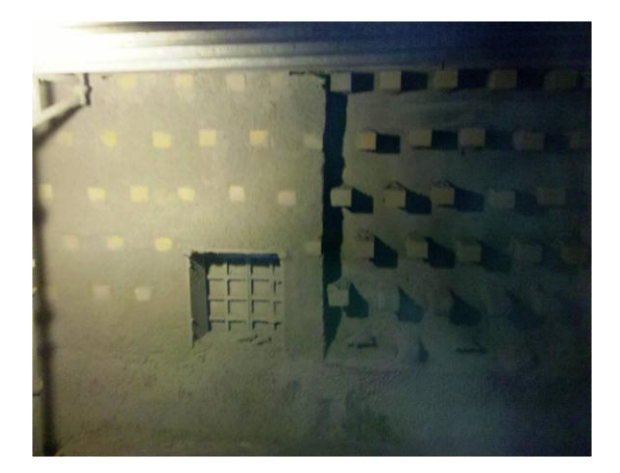
A wall recently shot with Q-TEK 32 GM. Overall appearance was of a wall rammed with plastic. The result was the also the same with a strong, phosphate bonded monolithic lining.

http://www.youtube.com/watch?v=QKRD2e49bAo